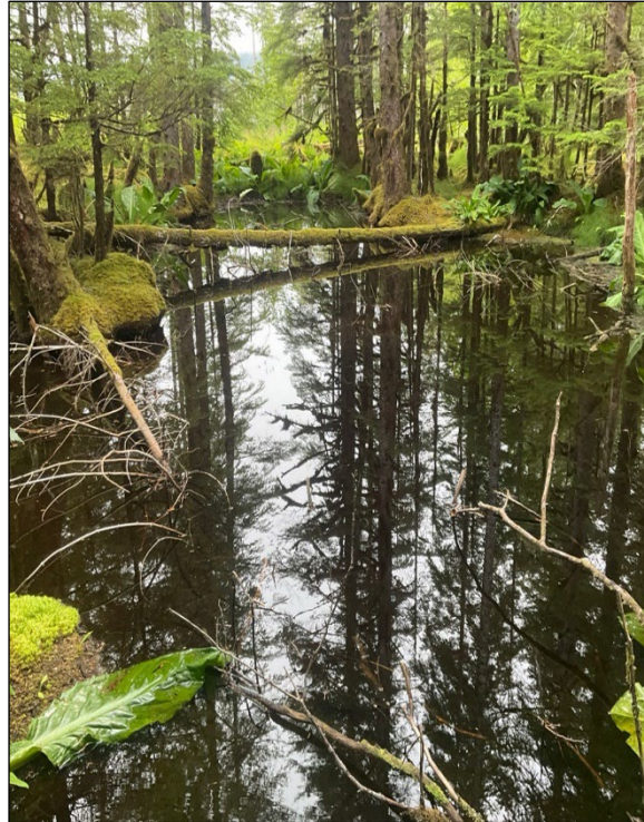
Figure 3.—Ponded water at waypoint 704.