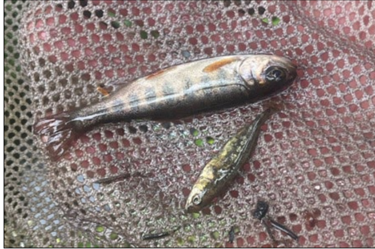
Figure 1.—Juvenile coho salmon caught at waypoint 709.