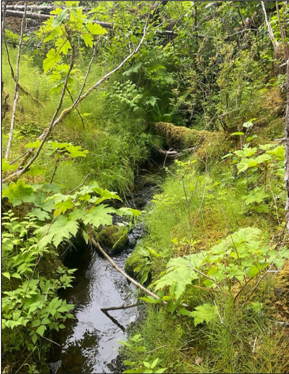
Figure 2.—Looking upstream at waypoint 705.